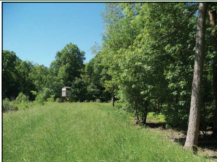
Much of the property is bordered by levees with deer stands that provide visibility of that big buck that is slipping through.