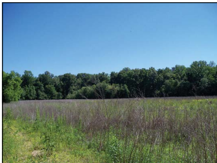
1 of 2 of the floodable fields is located within the green timber reservoir and provides excellent field hunting on the property.

The hunting cabin area is strategically located in the center of the property, and has been well planned to enhance the value of the ownership. A common storage and maintenance building owned by Lone Cypress Farms is easily accessible to all, and is used by each owner and guest for everything from repairing equipment, joining together before duck hunting, to dressing a deer. It includes a covered rack and walk-in meat cooler. There is always opportunity here for fellowship and lasting memories. The entire property has been developed for the full hunting experience. Duck holes in the green timber reservoir are systematically spread with 3 holes on the north end of the property and 3 holes on the south. 2 floodable fields provide the opportunity for field hunts, or you can set up in the flooded timber as duck hunting patterns change and ducks get shy. Old catfish ponds have recently been converted to crop production and can be flooded after the harvest. Lone Cypress Farms gives you the best diversity for duck hunting, all in one place. Each hole is inspected annually to determine if anything should be planted such as millet or other duck food. Each year after the duck season is over, corn is applied to the flooded areas to continue to nurture the imprint ducks to the property for future years.