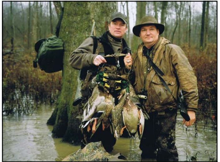
A successful morning hunt with a limit of greenheads in the flooded oak timber.

Current benefits included but not limited to for each 25% share: 1) Up to 6 hunters in a duck hole any day during the season including the owner, 2) The ability for an owner to designate 2 others to hunt in his place and enjoy the same benefits and responsibilities as he does, 3) A rotating draw for first pick of a duck hole with only 3 other shares, 4) Up to 4 deer hunters per group any day during deer season during designated times and areas, 5) Squirrel hunting and dove hunts when the sunflowers cooperate, 6) Fishing in 2 ponds at the entrance to the property, 7) Use of farm equipment owned by Lone Cypress Farms for recreational upkeep including bush hogging, disk-ing, planting food plots, etc., 8) Equal access and enjoyment of the ownership as the other interests, 9) A mutual shared goal with the other owners to nurture the duck hunting and recreational value of the property, 10) Ownership in a recreational property that can be shared with family and friends for generations to come.