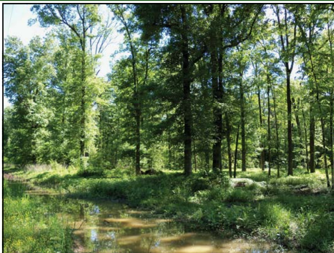
Oak timber in the green tree reservoirs provides acorns for the ducks and flooded timber hunting experience for the owner.

The hunting cabin area is strategically located in the center of the property, and has been well planned to enhance the value of the ownership. A common storage and maintenance building owned by Lone Cypress Farms is easily accessible to all, and is used by each owner and guest for everything from repairing equipment, joining together before duck hunting, to dressing a deer. It includes a covered rack and walk-in meat cooler. There is always opportunity here for fellowship and lasting memories. The entire property has been developed for the full hunting experience. Duck holes in the green timber reservoir are systematically spread with 3 holes on the north end of the property and 3 holes on the south. 2 floodable fields provide the opportunity for field hunts, or you can set up in the flooded timber as duck hunting patterns change and ducks get shy. Old catfish ponds have recently been converted to crop production and can be flooded after the harvest. Lone Cypress Farms gives you the best diversity for duck hunting, all in one place. Each hole is inspected annually to determine if anything should be planted such as millet or other duck food. Each year after the duck season is over, corn is applied to the flooded areas to continue to nurture the imprint ducks to the property for future years.