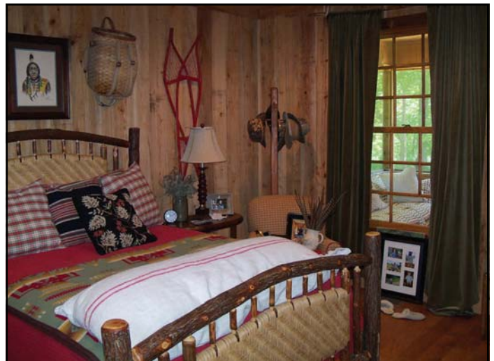
The master bedroom has a rustic appeal with pecky cypress siding and a beautiful view to the back porch and beyond.