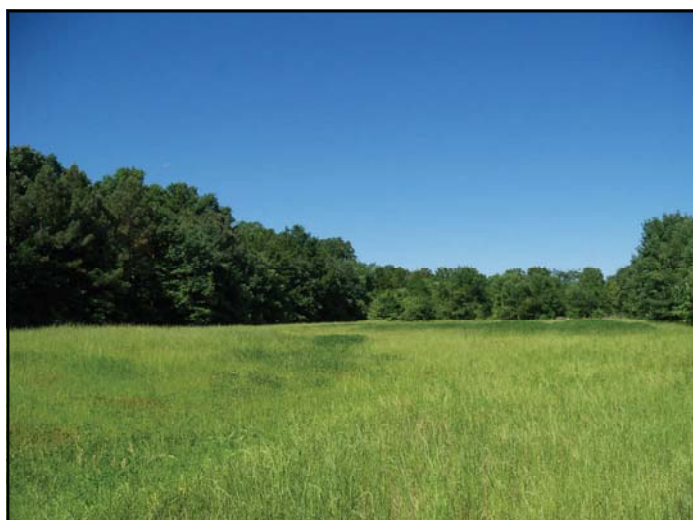
Deer food plots are planted each year. Several locations have existing stands for rifle, muzzleloader, and bow hunting.

From your cabin, you have an easy ATV ride to anywhere on the property. Levees give you access to all duck holes and several locations for deer hunting. The owners recently completed a 5 year capital improvement plan over the property to maximize duck hunting. This includes levees with pipe structures for holding water, wells with submersible pumps to retrieve water for flooding if Mother Nature does not cooperate, and a common building with light duty farm equipment for maintenance and storage. The ownership adheres to the DMAP program as described by the Arkansas Game and Fish Commission and has an 8 point buck deer rule in place. Wildlife food plots are maintained for deer hunting, offering this added benefit in the event duck hunting is slow.