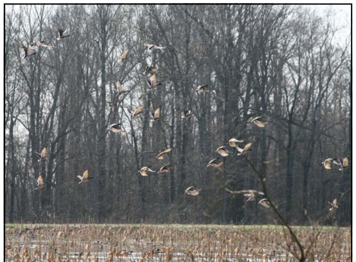
Lone Cypress Farms has both flooded timber and floodable fields to offer the right hunting setup to match the conditions.