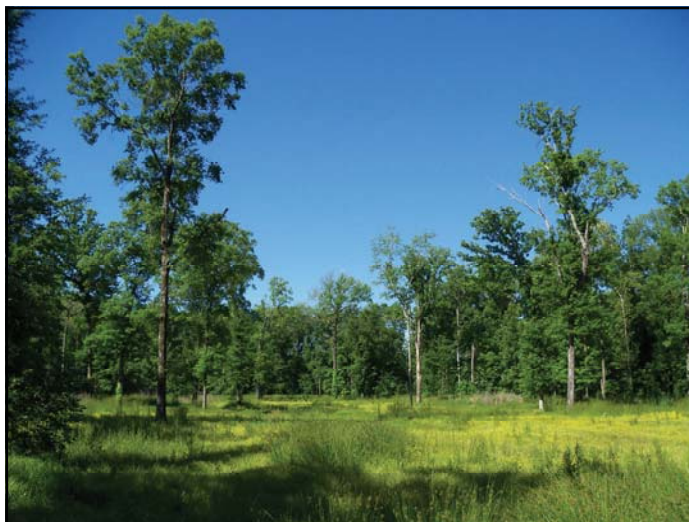
The duck holes in the timber are large enough to enable planting but small enough to predict where the ducks will fly in.