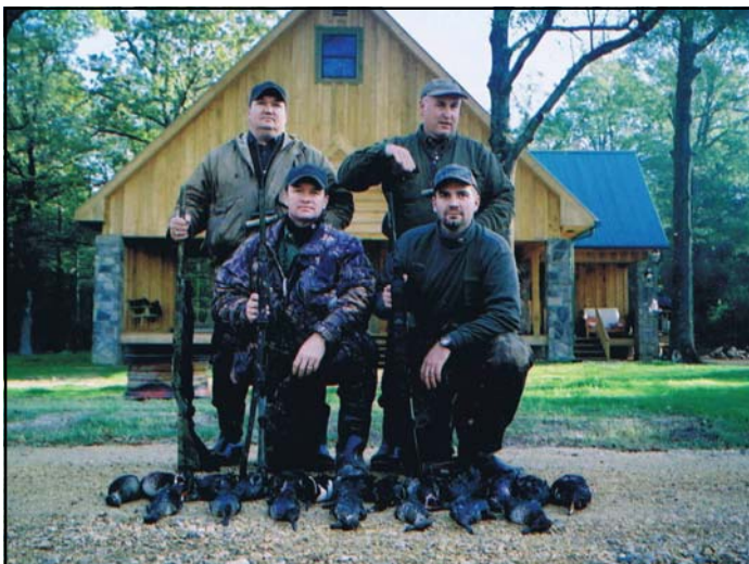
A good morning hunt for four after an enjoyable nights stay at the lodge. This property offers the full hunting experience.

Current benefits included but not limited to for each 25% share: 1) Up to 6 hunters in a duck hole any day during the season including the owner, 2) The ability for an owner to designate 2 others to hunt in his place and enjoy the same benefits and responsibilities as he does, 3) A rotating draw for first pick of a duck hole with only 3 other shares, 4) Up to 4 deer hunters per group any day during deer season during designated times and areas, 5) Squirrel hunting and dove hunts when the sunflowers cooperate, 6) Fishing in 2 ponds at the entrance to the property, 7) Use of farm equipment owned by Lone Cypress Farms for recreational upkeep including bush hogging, disk-ing, planting food plots, etc., 8) Equal access and enjoyment of the ownership as the other interests, 9) A mutual shared goal with the other owners to nurture the duck hunting and recreational value of the property, 10) Ownership in a recreational property that can be shared with family and friends for generations to come.