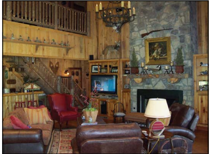
The large great-room provides a central location for family and friends with a stone fireplace and built in cabinets.

The cabin is a 2,700 sq. ft., two story, get away with cypress board and bat exterior walls and tongue and groove cypress interior walls. Outside the cabin you have a wrap around front porch, a screened in back porch, and an upstairs wooden balcony for enjoying the view. From the front porch the front entrance boasts 2 double pine French doors bringing you into a spacious downstairs great room with vaulted ceiling, a huge stone fireplace, built in one-of-a-kind Ducks Unlimited gun safe, and an open view of the kitchen and upstairs balcony. From the great room you have direct access to the kitchen and 2 bedrooms with an adjoining full bath. Enter from the side and you pass the half-bath and utility room. The kitchen includes stainless steel refrigerator, dish washer, and stove, metal hangers for pots and pans, and plenty of counter top space. A wooden stairway with cedar railing carries you upstairs to a spacious balcony and a huge bedroom-entertainment room complete with recessed mini refrigerator and bar. The upstairs has a full bath and additional storage space in a floored attic area. The open design of this cabin enhances closeness to family or friends, cozy relaxation, and enjoyable entertainment. The 2 downstairs bedrooms can sleep from 1 to 4 each and the upstairs bedroom can sleep from 4 to 8, depending on how many folks want to bunk in. All interior ceilings and walls are cypress. All floors are hickory except the upstairs entertainment room which is carpeted.