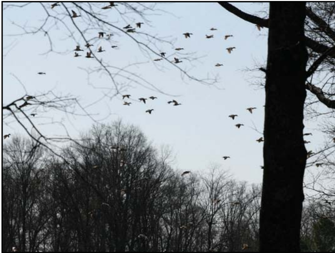
Flocks of Mallards fall into one of the flooded fields surrounded by flooded green timber on Lone Cypress Farms.