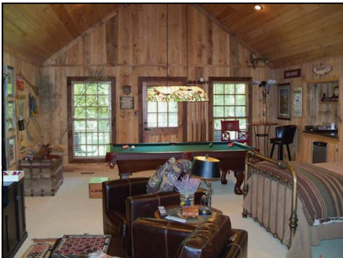
The upstairs room is a combination guest room and game room, with ability to sleep several as well as entertain.

The cabin is a 2,700 sq. ft., two story, get away with cypress board and bat exterior walls and tongue and groove cypress interior walls. Outside the cabin you have a wrap around front porch, a screened in back porch, and an upstairs wooden balcony for enjoying the view. From the front porch the front entrance boasts 2 double pine French doors bringing you into a spacious downstairs great room with vaulted ceiling, a huge stone fireplace, built in one-of-a-kind Ducks Unlimited gun safe, and an open view of the kitchen and upstairs balcony. From the great room you have direct access to the kitchen and 2 bedrooms with an adjoining full bath. Enter from the side and you pass the half-bath and utility room. The kitchen includes stainless steel refrigerator, dish washer, and stove, metal hangers for pots and pans, and plenty of counter top space. A wooden stairway with cedar railing carries you upstairs to a spacious balcony and a huge bedroom-entertainment room complete with recessed mini refrigerator and bar. The upstairs has a full bath and additional storage space in a floored attic area. The open design of this cabin enhances closeness to family or friends, cozy relaxation, and enjoyable entertainment. The 2 downstairs bedrooms can sleep from 1 to 4 each and the upstairs bedroom can sleep from 4 to 8, depending on how many folks want to bunk in. All interior ceilings and walls are cypress. All floors are hickory except the upstairs entertainment room which is carpeted.