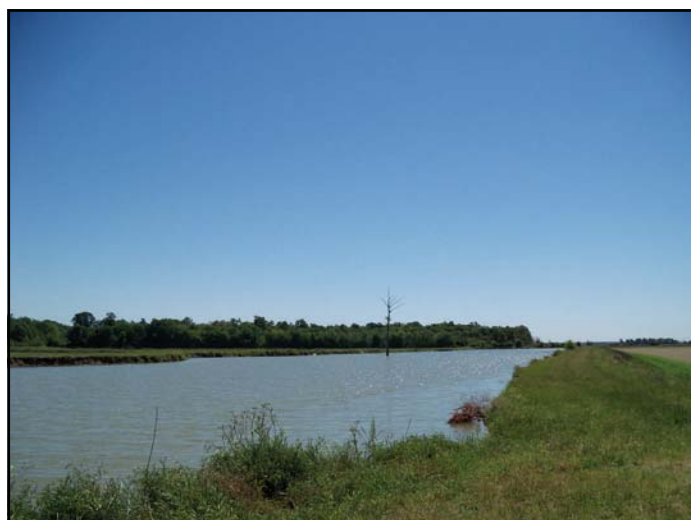
As you enter the property The Lone Cypress, namesake of the property, stands in the pond containing bass and other fish.