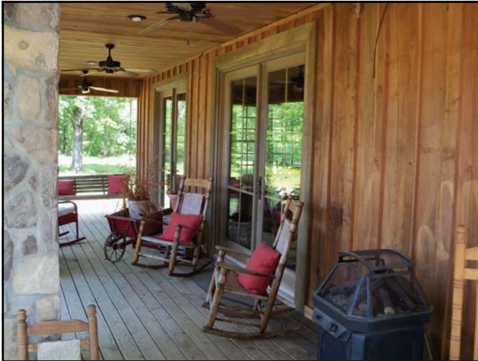
This roomy front porch provides endless relaxation and an entrance to the cabin through oversized glass french doors.