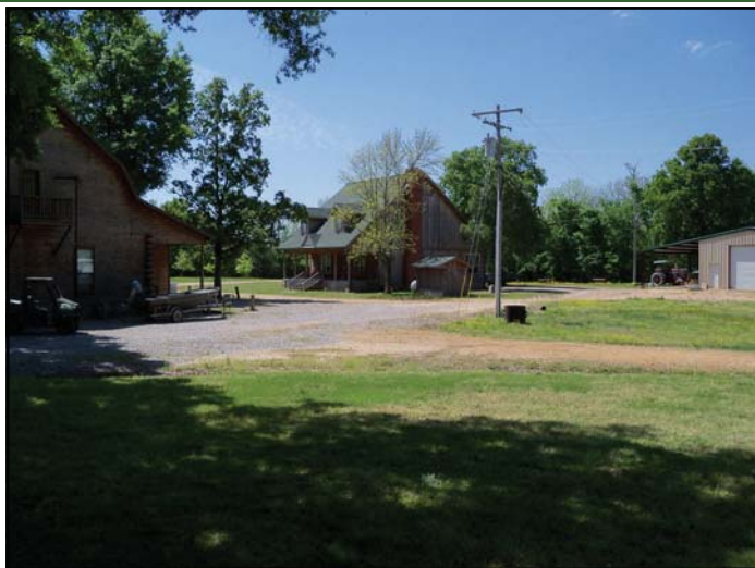
View from the front porch shows the Lone Cypress common area with the cabins of the other owners and a common use building.