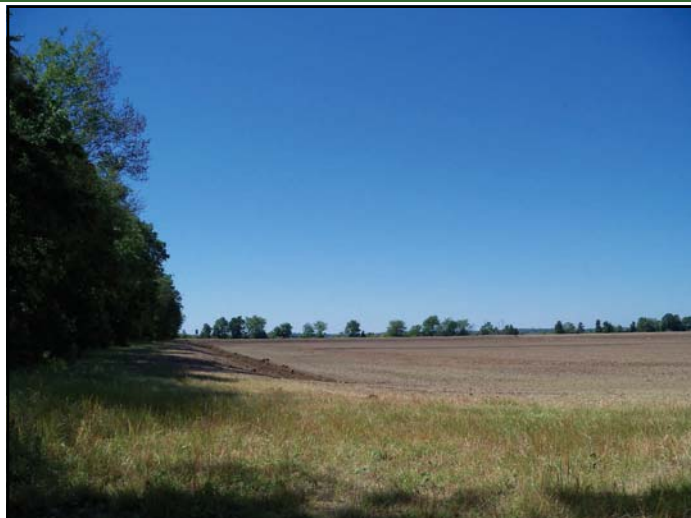
Old catfish ponds have been converted to floodable cropland and are expected to provide some great duck hunting.

From your cabin, you have an easy ATV ride to anywhere on the property. Levees give you access to all duck holes and several locations for deer hunting. The owners recently completed a 5 year capital improvement plan over the property to maximize duck hunting. This includes levees with pipe structures for holding water, wells with submersible pumps to retrieve water for flooding if Mother Nature does not cooperate, and a common building with light duty farm equipment for maintenance and storage. The ownership adheres to the DMAP program as described by the Arkansas Game and Fish Commission and has an 8 point buck deer rule in place. Wildlife food plots are maintained for deer hunting, offering this added benefit in the event duck hunting is slow.