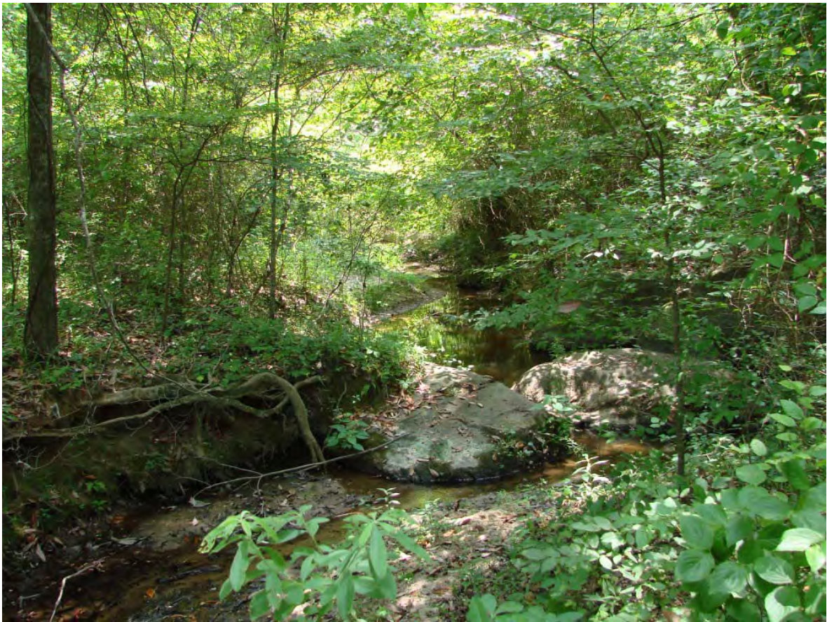
This creek crosses the northeast corner of the property