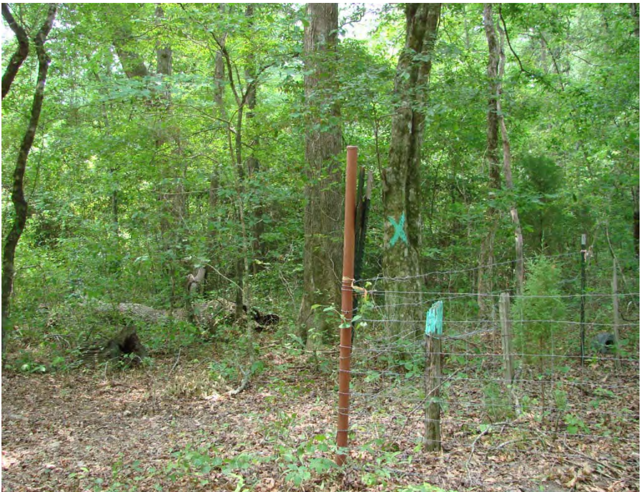
The corners and lines are marked