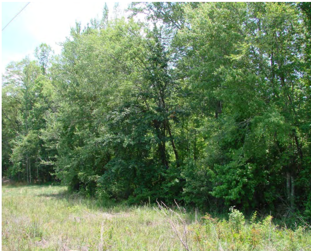
A view of the trees along the powerline