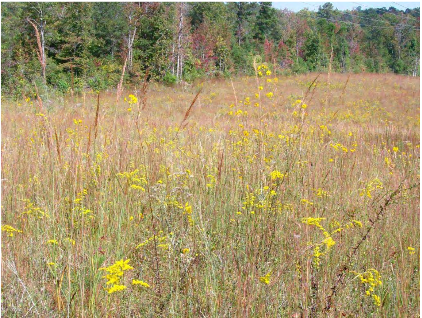
A meadow under the powerline