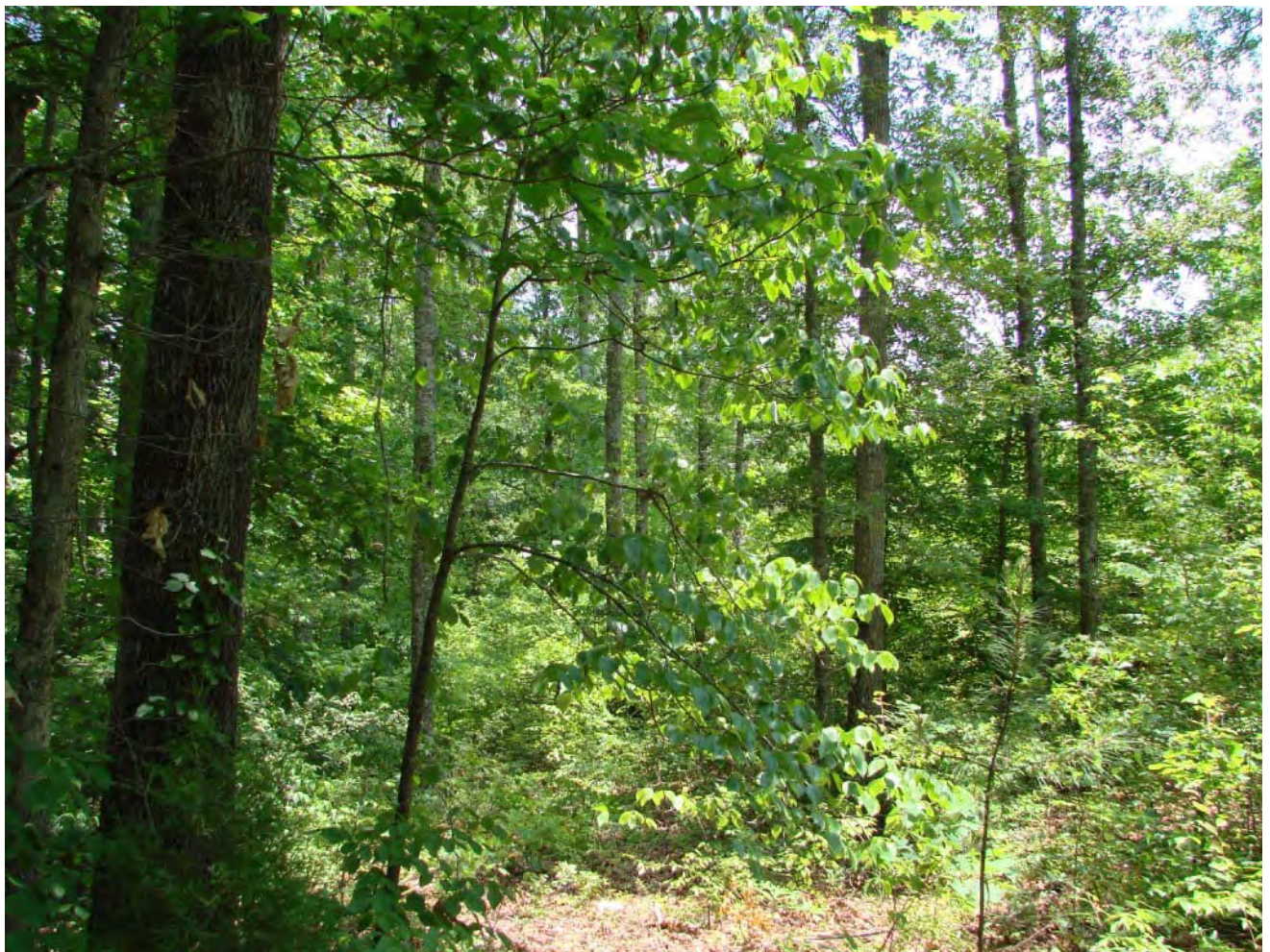
Hardwood forest along the creek