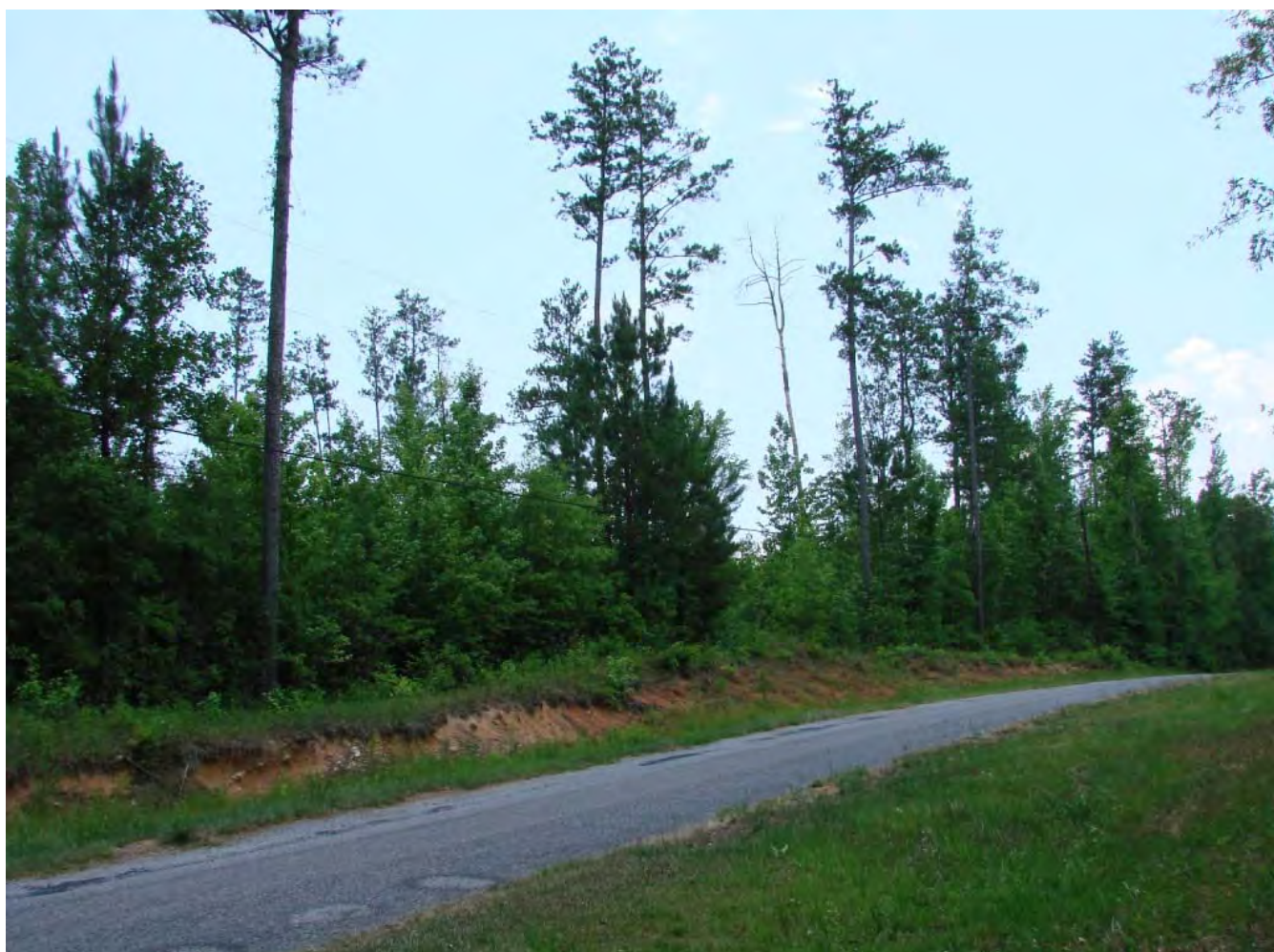
County road frontage