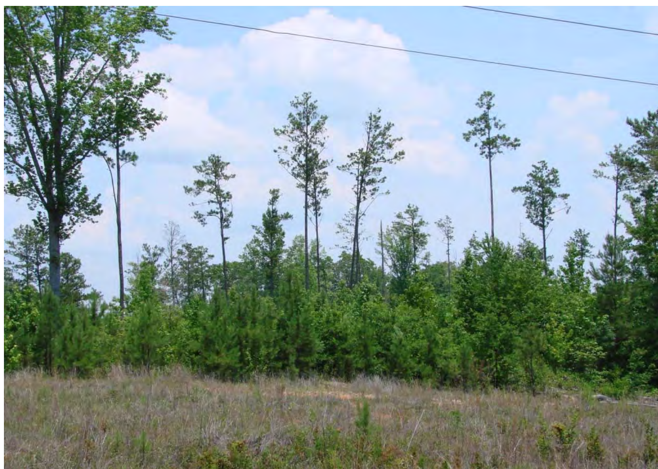
A view of pine seed trees – lots of young pine starting to grow