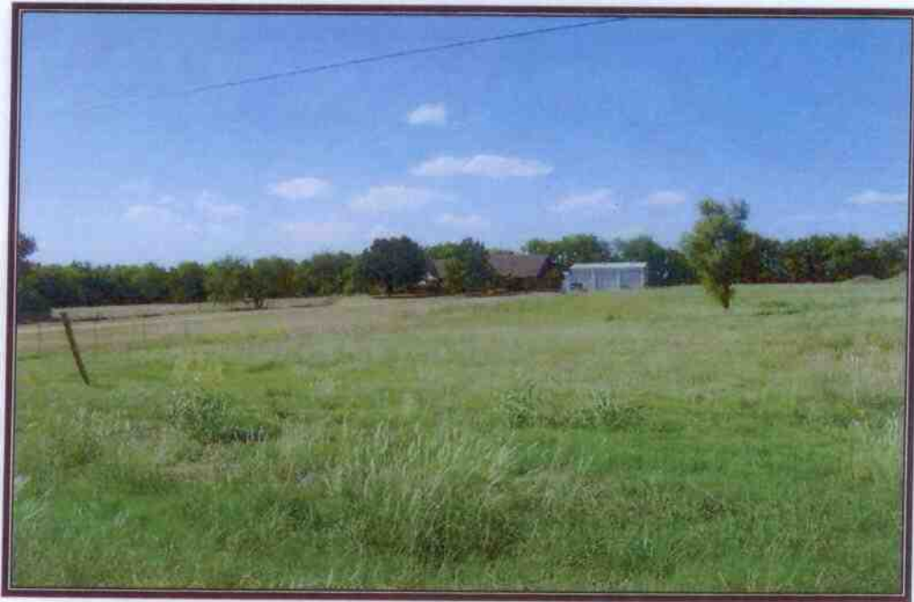
3. View along the western portion of the site, facing north.