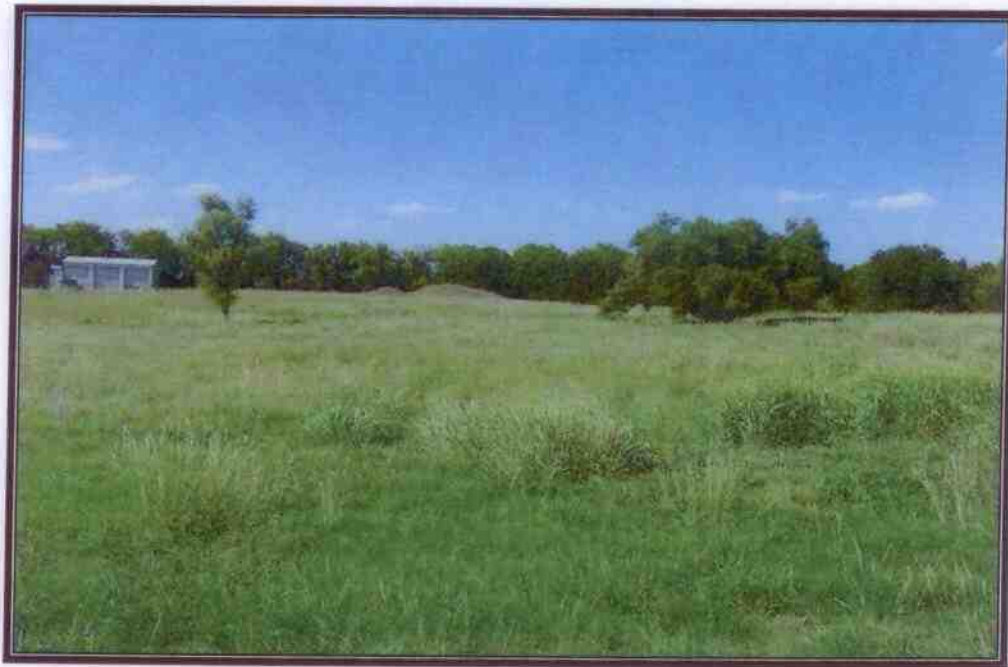
4. View across the subject property, facing north.