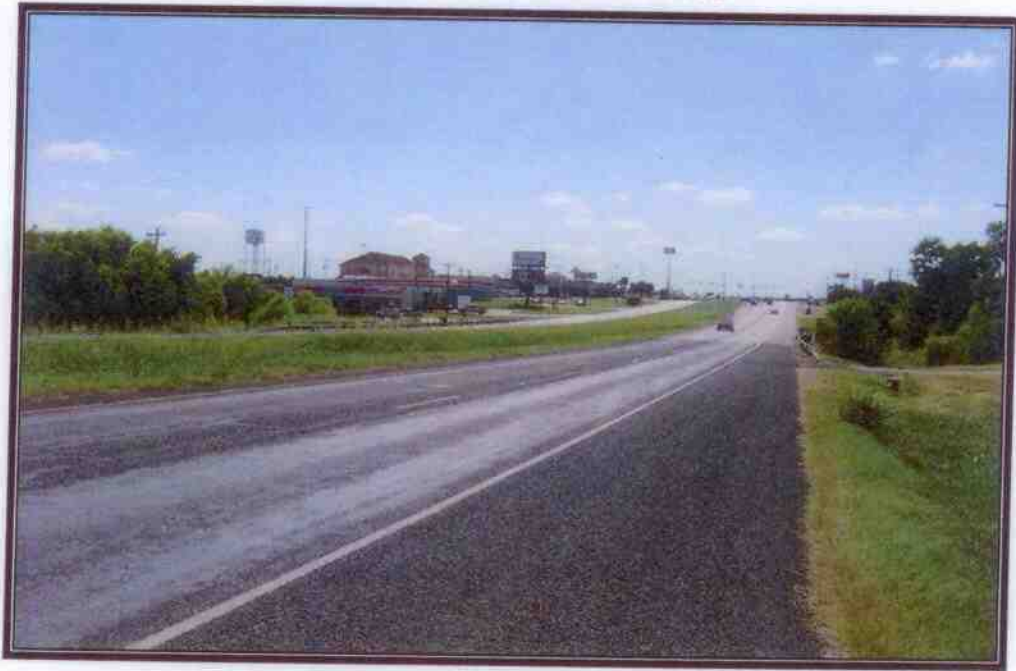
1. View along US Highway 67, facing west; subject fronts on the right. Note: the traffic is one-way in a westbound direction.