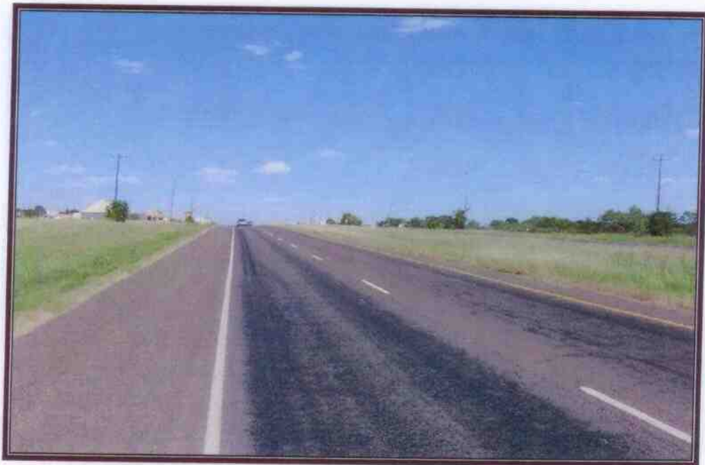
2. View along US Highway 67, facing east; subject fronts on the left. Note: There is no access across the dividing grassy median shown at the right of photo.