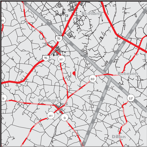
LOCATION MAP scale 1 inch = 5 miles