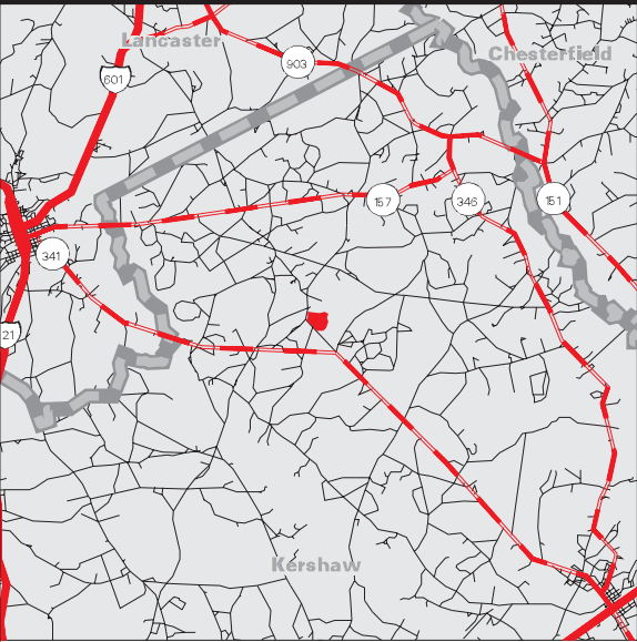
LOCATION MAP scale 1 inch = 5 miles