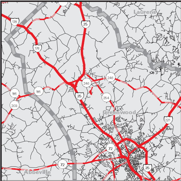
LOCATION MAP scale 1 inch = 5 miles