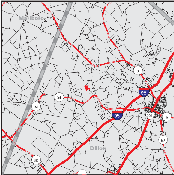
LOCATION MAP scale 1 inch = 5 miles