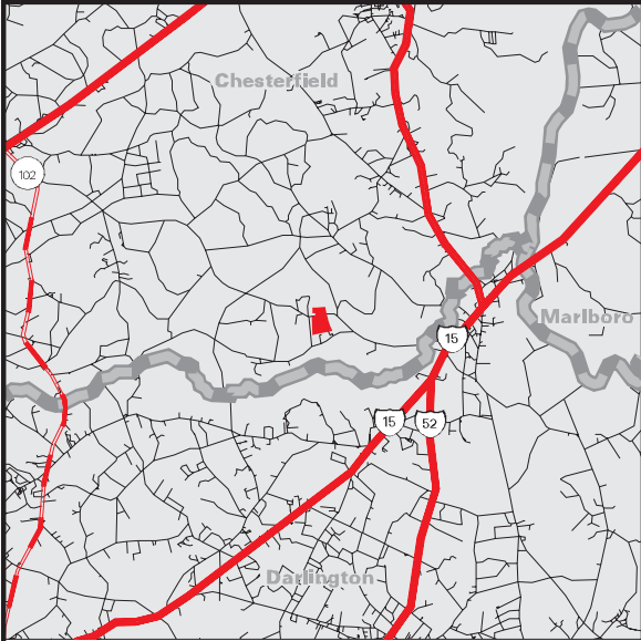
LOCATION MAP scale 1 inch = 5 miles