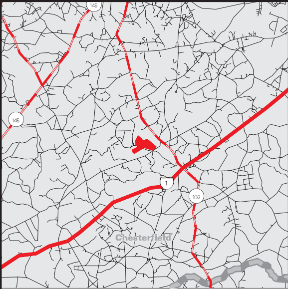
LOCATION MAP scale 1 inch = 5 miles