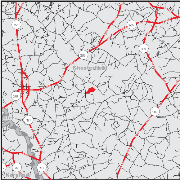
LOCATION MAP scale 1 inch = 5 miles