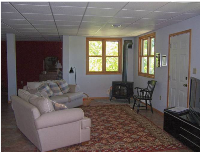
Finished basement with free standing Gas stove