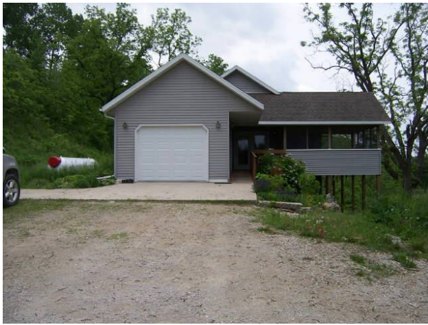
1 stall garage