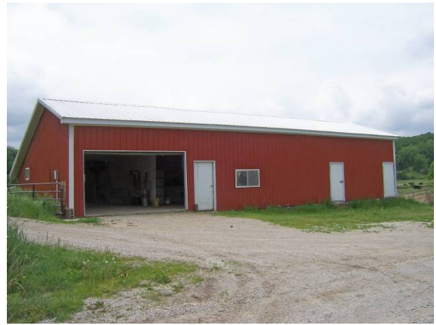
Shed with garage