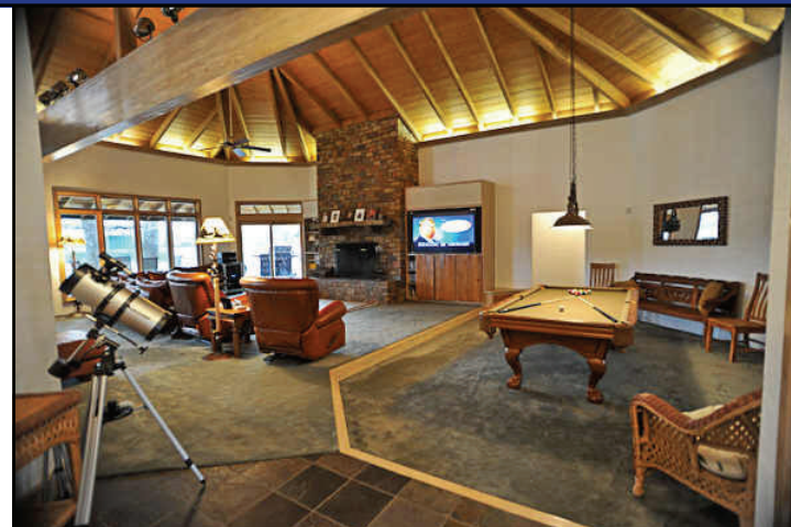
Great Room view from Game Room.

Heated in ground Pool and spa and view of main home from backyard. 625 SF Covered Cabana with shower.