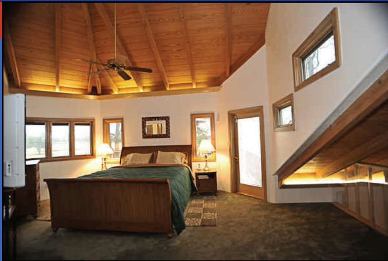
Master Suite of Main Home