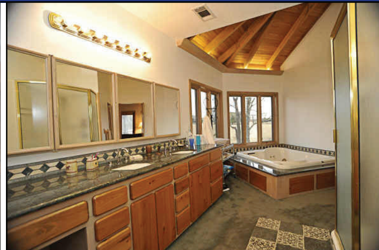
Master Bath Main Home