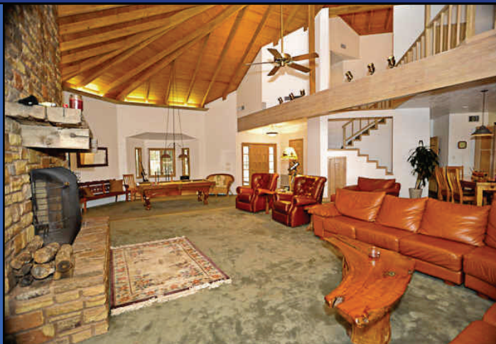
Great Room with fireplace , accent lighting overhead. Kitchen with Island, granite counters and slate floors.