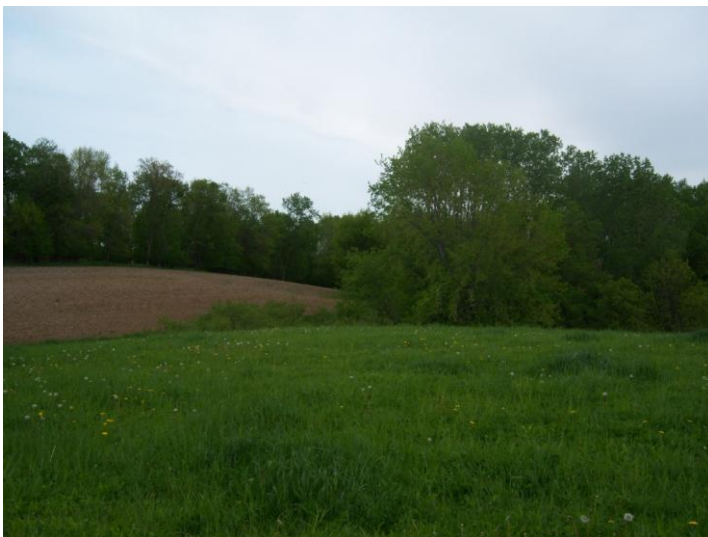
Timber and Cropland