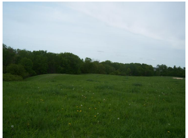
Timber and Cropland

The information gathered for this brochure is from sources deemed reliable, but cannot be guaranteed by Hertz Real Estate Services or its staff. All acres are considered more or less.