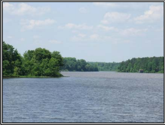
4 MILES +/- OF WATER FRONTAGE