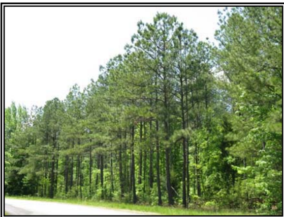
PINES ALONG ROUTE 623