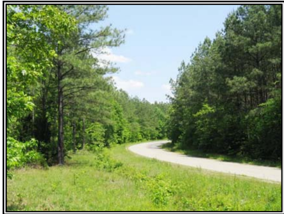
FRONTAGE ON ROUTE 623 (LEFT SIDE)