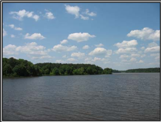
WOODED WATERFRONT ON LEFT