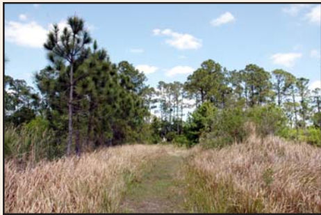
Scattered Oaks, Hammocks