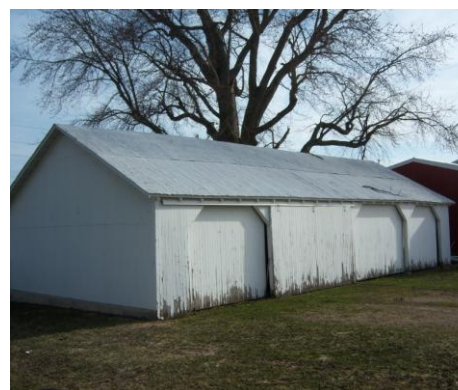
West Machine Shed