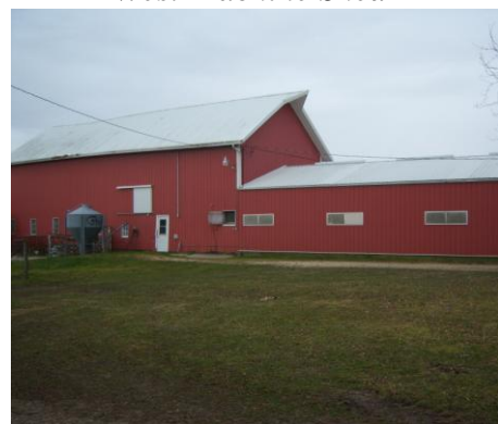
Dairy Barn & Machine Shed