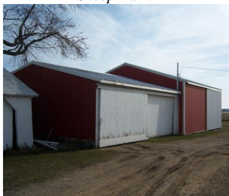
East Machine Shed