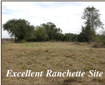
Excellent Ranchette Site