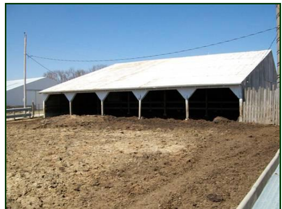
Open Front Cattle Shed