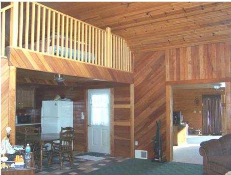
Loft bedroom, kitchen, living room, additional room.