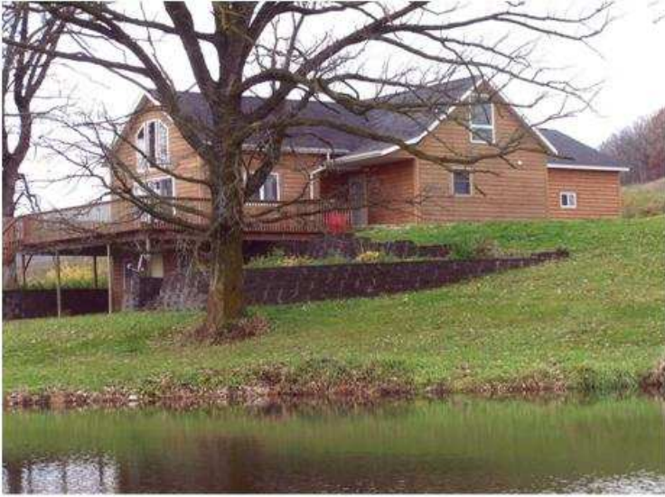
View of back of house with pond.