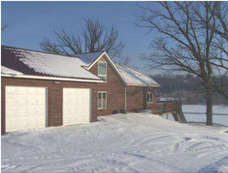
View of front of house.