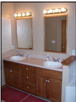
Master Bath #4