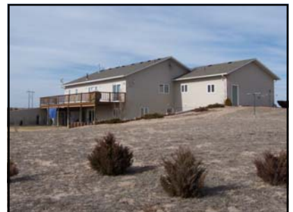
Back View #2