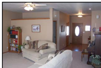
Living Room showing front door