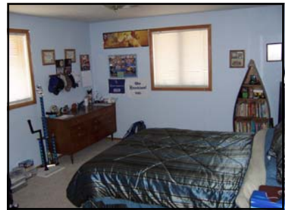
Basement Bedroom #1