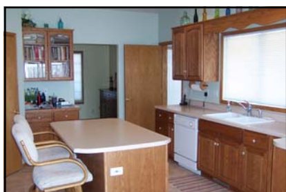
Kitchen with Breakfast Area

You can enjoy this beautiful country home on 9.3 acres with great views. This 3,372 sq. ft. home features 1,716 sq. ft. on the main floor and 1,656 sq. ft. in the basement. This like-new home was built in 2000, and offers extra features such as attached two-car garage, covered front porch, walk-out basement, large deck and dog kennel & runs. Located 4 1/2 miles west & 2 miles north of Wray.