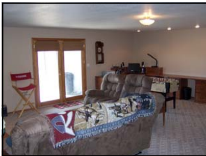
Basement Family Rm.#2