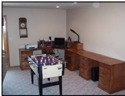
Basement Off Area