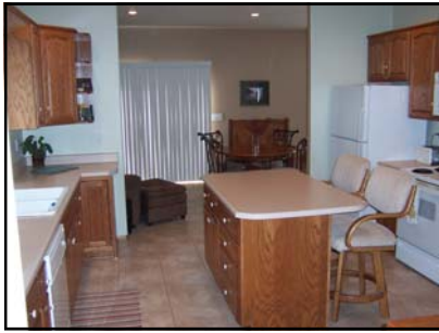
Kitchen with Breakfast Area