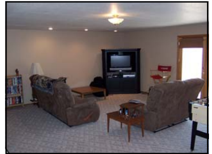
Basement Family Rm.