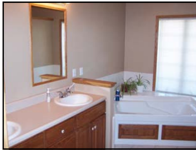
Master Bath #3