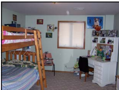
Basement Bedroom #2