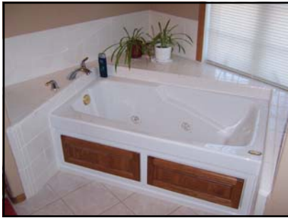
Master Bath #2