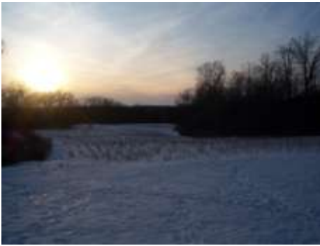
What A View!