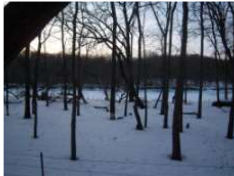
Wapsipinicon River Frontage