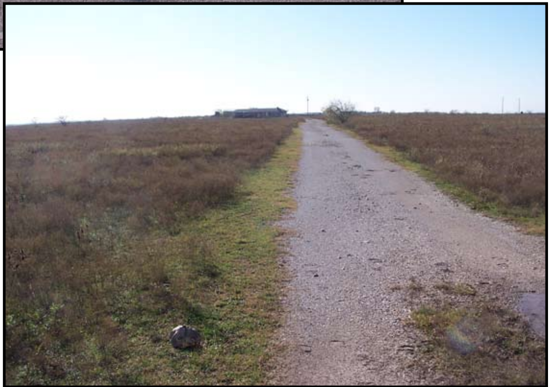
House and Road