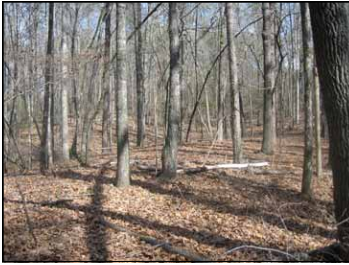
Top Left & Right: Hardwood on North Tract