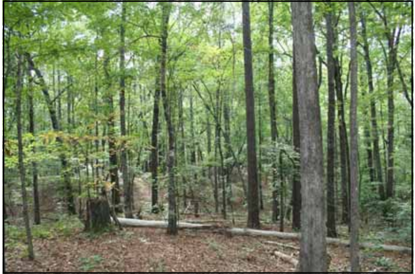
Top Left & Right: Hardwood on North Tract