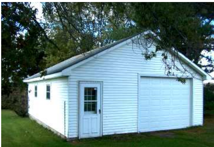
32 x 22 Outbuilding