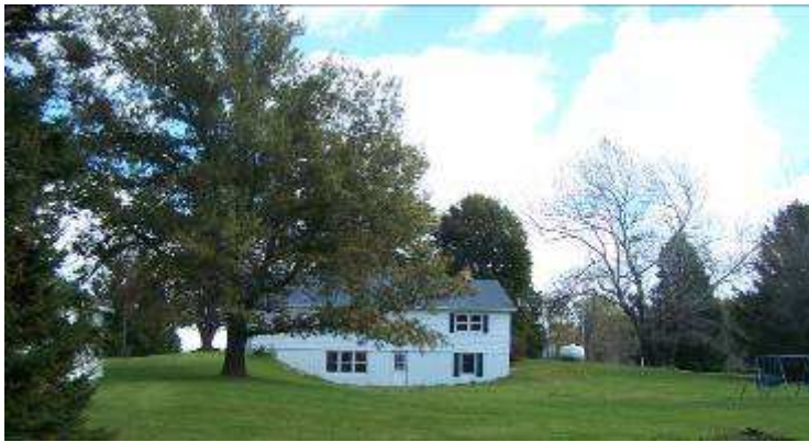
View of back of house.