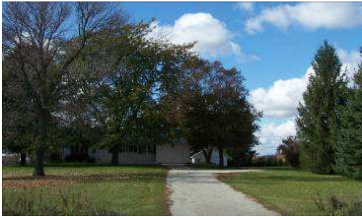
View of front of house.