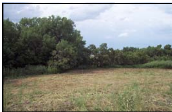
Grass & Timber

If you're looking for a secluded place in the country, then this home and acreage may be perfect for you. The Big Timber Creek runs through this 40± acre ranch north of Bird City, featuring lots of trees and wildlife, which would be ideal for hunting. This property includes a 1,026 sq. ft. home with 3 bedrooms and 1 1/2 baths, an older guest home, and barn.