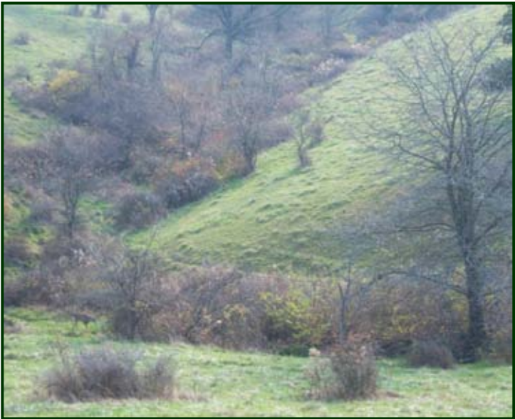
Timber and Pasture