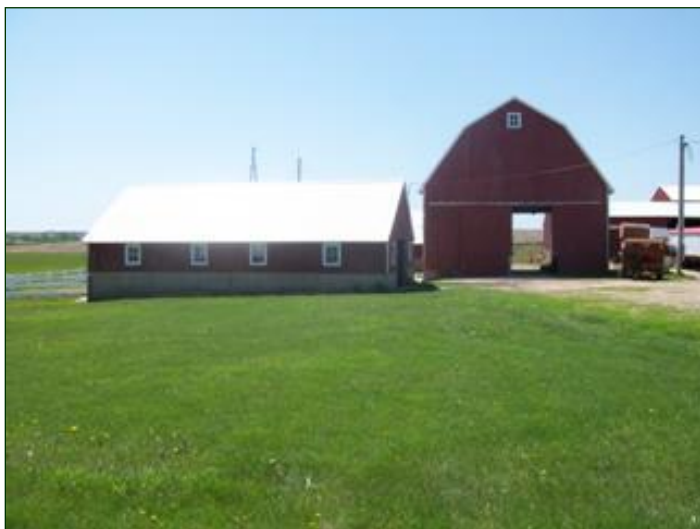
Calf Barn and Corn Crib

BROKER'S COMMENTS: This farm is ideally set up for a 50 to 70 head dairy operation. It includes a newer DeLaval double four step-up milking parlor, good outbuildings and a newer home. The facilities also include concrete lots and fence line bunks.