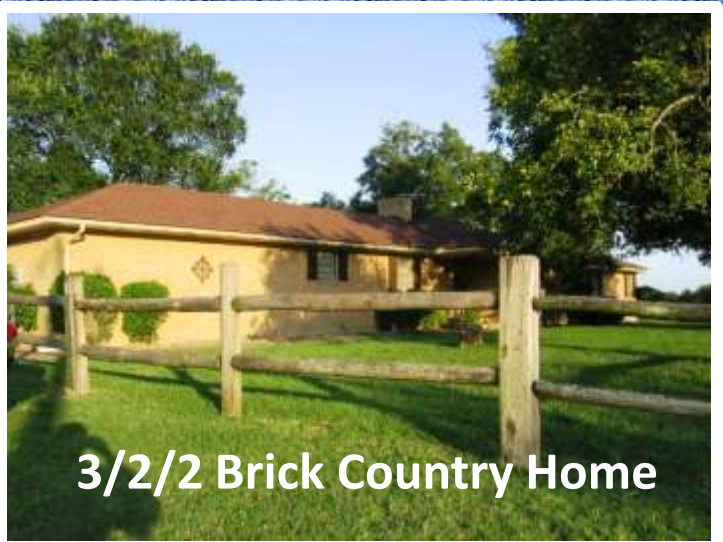
3/2/2 Brick Country Home