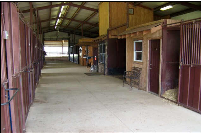
20 Stall Horse Barn, Air Conditioned Tack Room, Feed Room, Wash Rack, Apartment