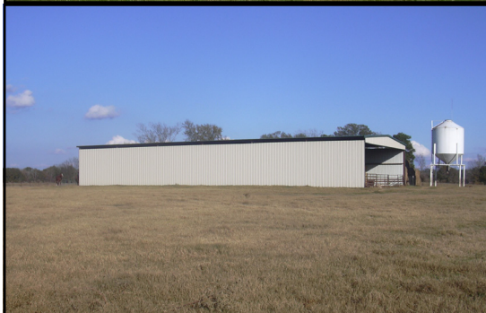
400 roll capacity hay barn

A rare find, must see this 1021 acres , all contiguous, located northwest of Longview and only 2 hours from Dallas. The Ranch runs 300 pairs year around. Eleven (11) ponds/lakes plus spring fed streams provide plenty of water year around. Ranch is professionally managed and meticulously maintained. Improved grasses, excellent fencing and cattle pens, cross fenced insure a highly productive cattle operation.