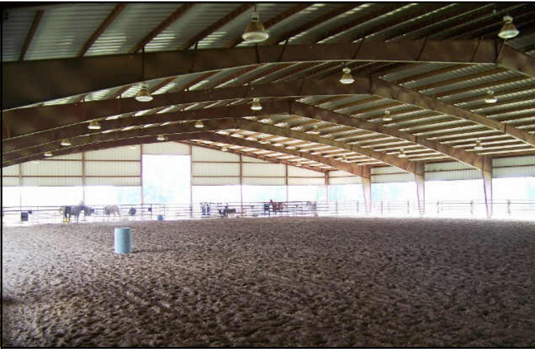
125' X 250' Indoor Arena