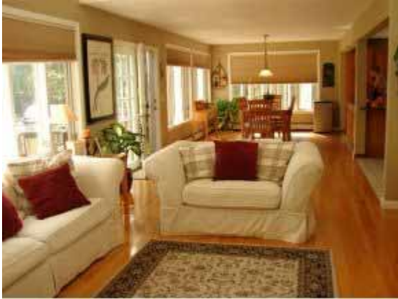
Bright Open Floorplan