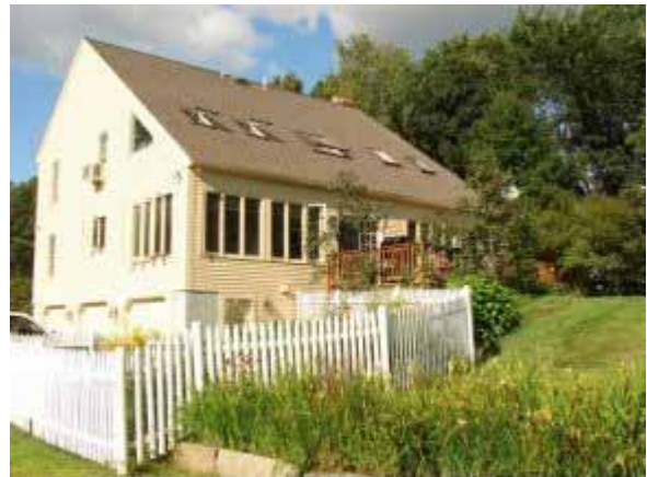
Deck in rear fenced in area

Subject to errors, omissions, prior sale, change or withdrawal without notice. The agency referenced may or may not be the listing agency for this property. Copyright 2006 Northern New England Real 08/14/2009 05:07 PM Printed By: Sally Mann