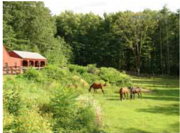
More Fenced paddocks