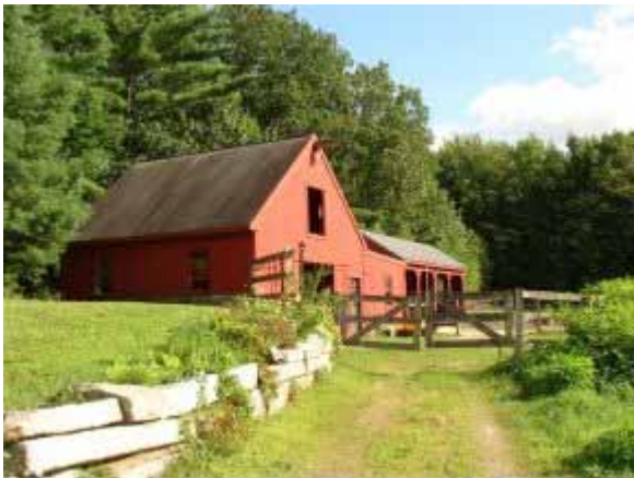
3 stall barn-grain room-loft