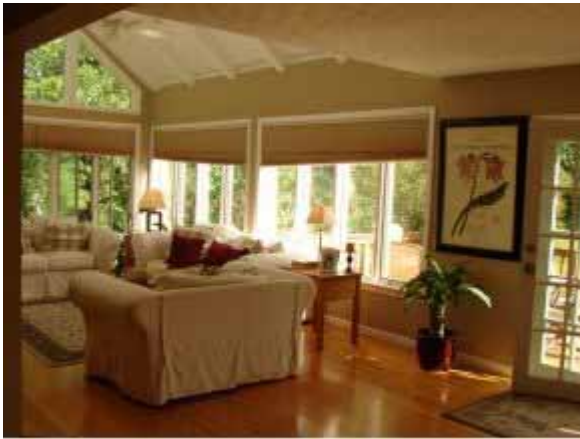
Living Room Cathedral Ceiling