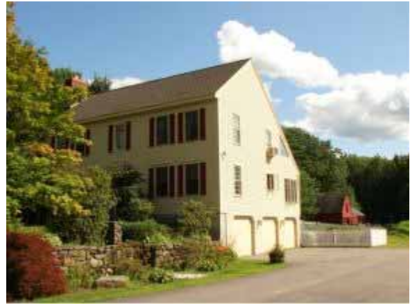
4BR home 3-car garage Barn