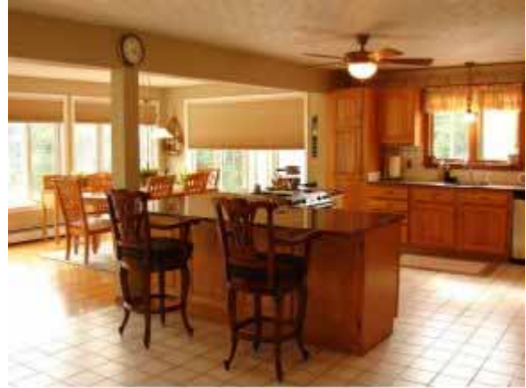
Open kitchen w granite counter