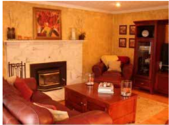
Cozy Den Living Room w FP