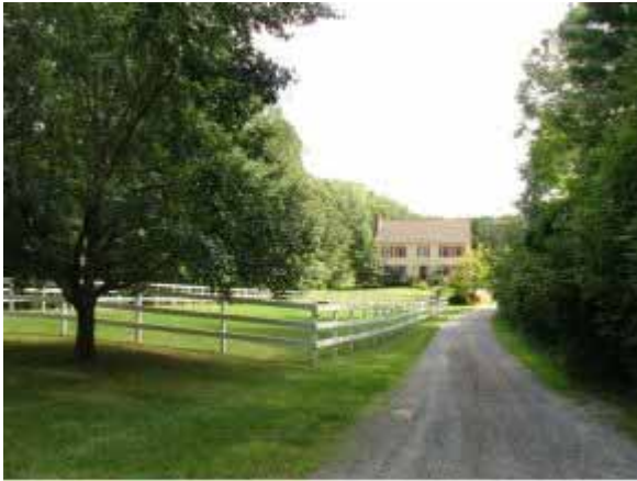
Long driveway offers privacy