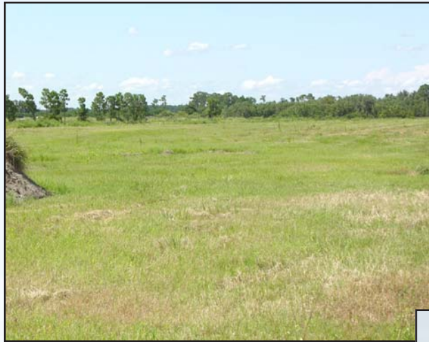
Lake Haines Frontage