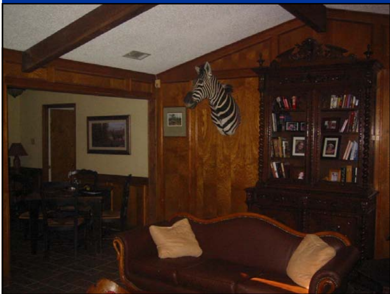
Great Room in Main House