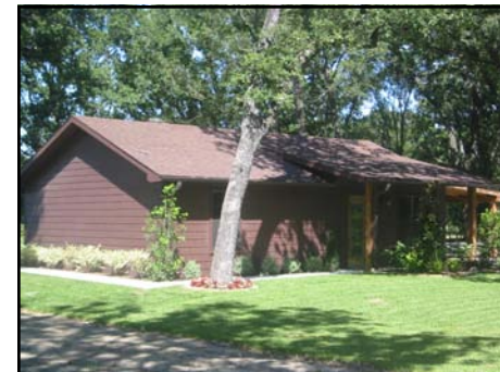
Guest House, 1000SF

High fenced exotic game ranch with beautiful rolling meadows scattered mature oak trees, deep sandy soil, plenty of lakes, and live creek. Improved pastures, exotic game including elk, axis deer, black buck and many other species. No cattle on property but would make excellent cattle operation. Makes over 1000 large round rolls of hay per cutting. Home has been meticulously updated. wonderful new guest house (1000 sf). Equipment barn, new large hay barn, horse barn w/stalls, dog kennels and workshop. Fenced and cross fenced. (Game not included in price)