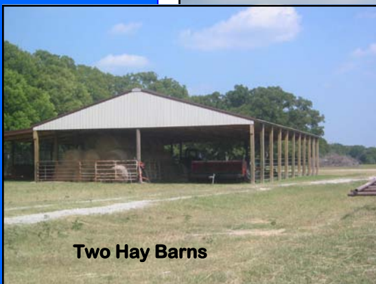
Two Hay Barns