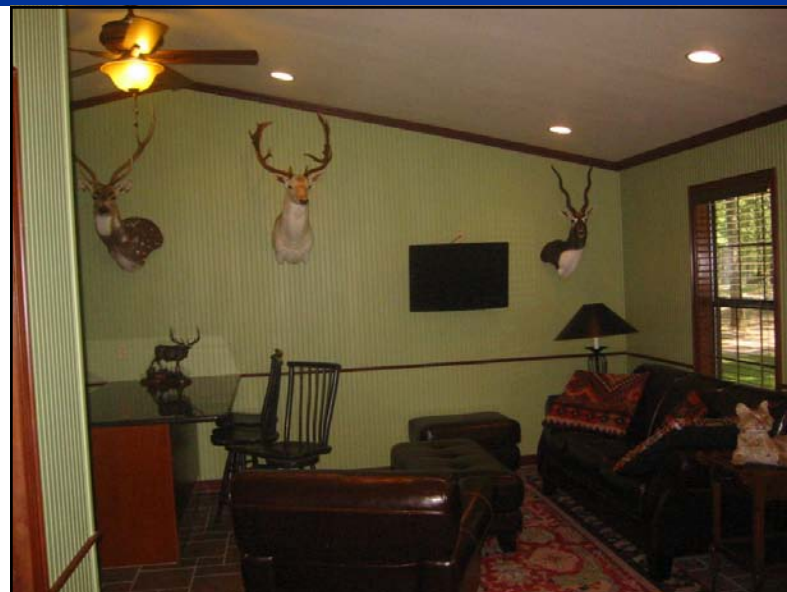
Guest House: Built in 2008 offers attractive great room. Kitchen and breakfast bar with granite.