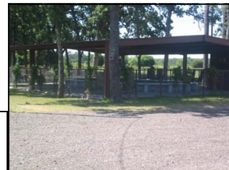
Covered Cabana with Pool