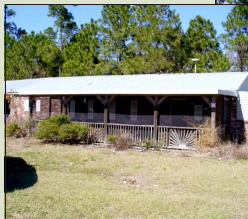
1 Bedroom Home with Large Garage

1 BR home with large garage 4 +/- acres abandoned grove