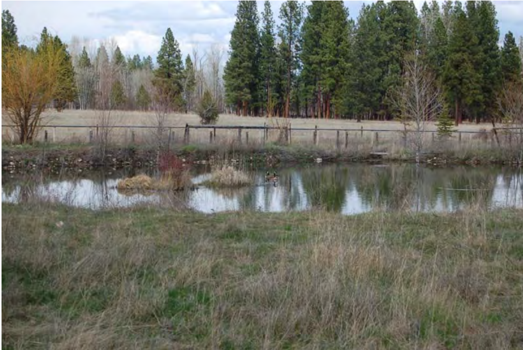
Pond with geese in spring – fed by seasonal creek