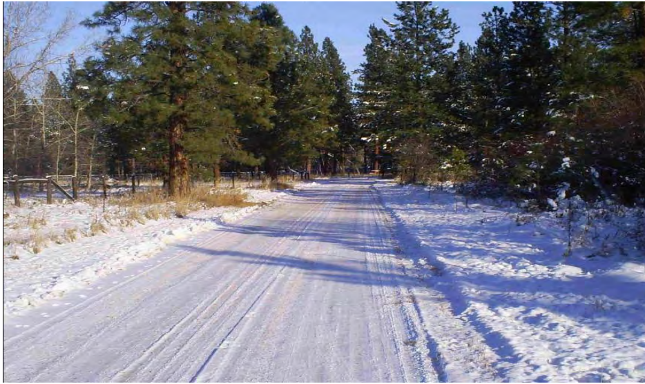
Paso Drive – well maintained and safe