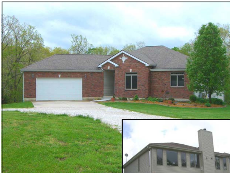
TALL OAKS SUBDIVISION