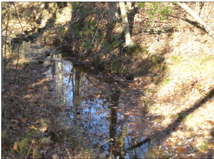
Representative photo of creek