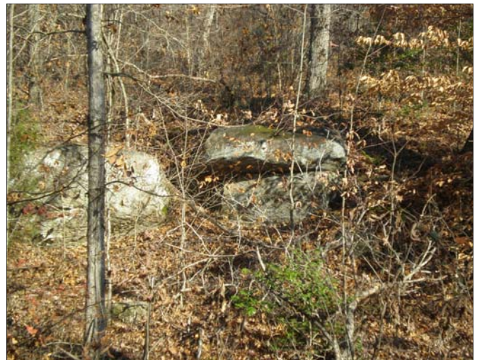
Natural rock outcropping