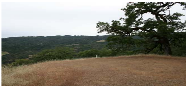
The property is only 25 minutes from Ukiah