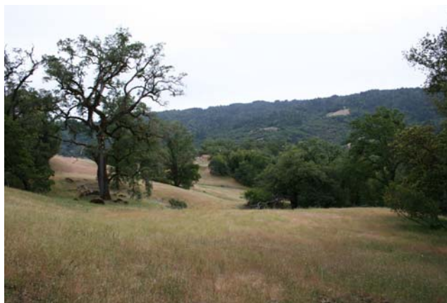
Gorgeous meadows with oaks