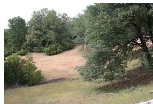
Building site with perc test