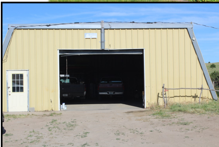
Slant-Walled Steel Building