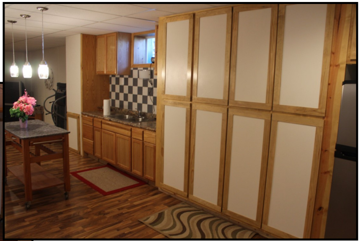
Basement Wet Bar