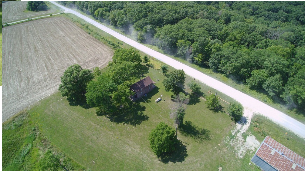
Drone Picture of Southern Portion of the Property.