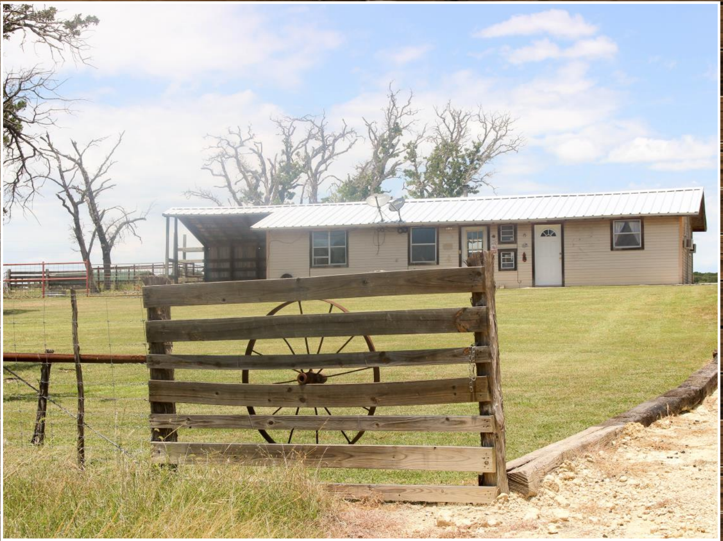
3 Bedroom, 1 Bath Frame House • 987 Sq. Ft. Perfect for a weekend getaway!