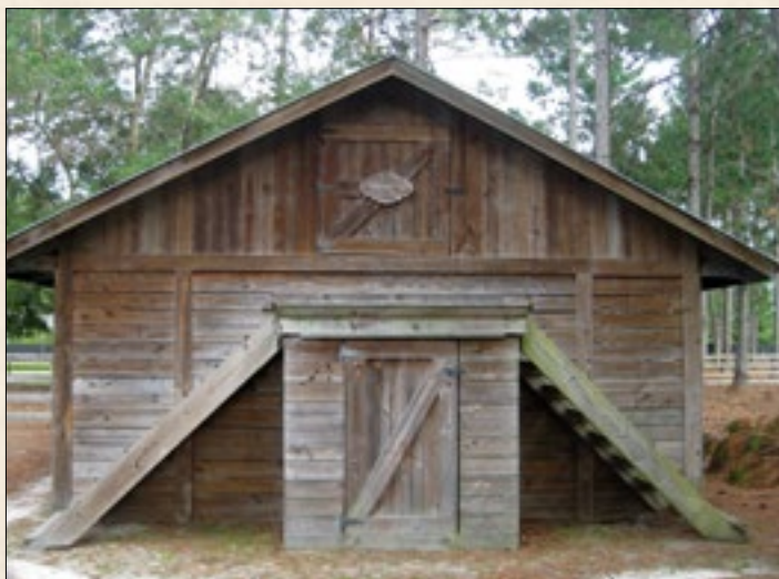
10-Stall Horse Barn with Tack Room+ Hayloft