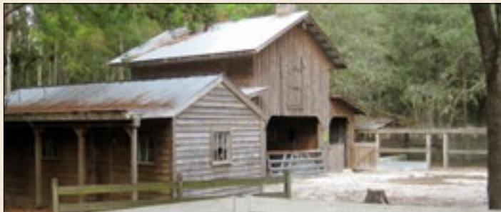
Barn & Tool Shed