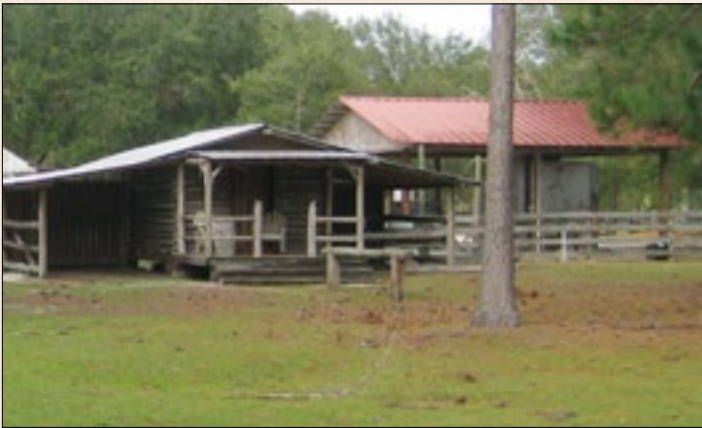
Tack Room & Skinning Shed