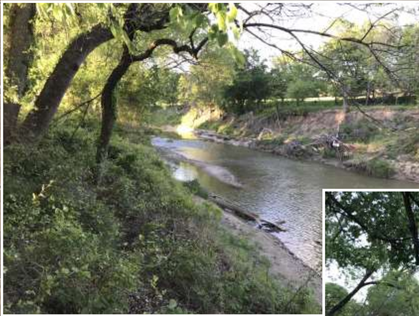
Half Mile of Leon River Frontage