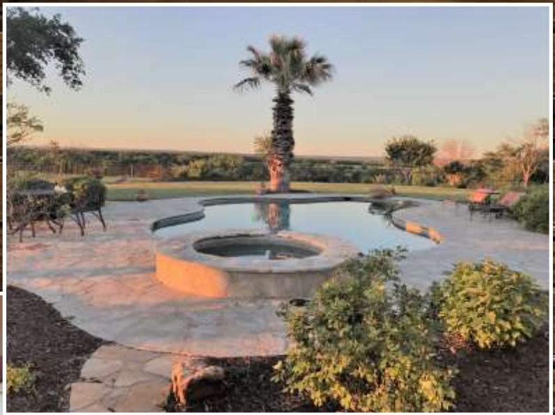
Living with a View & A Wood Burning Stove