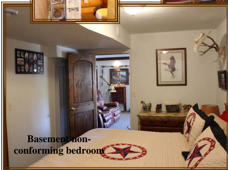
Basement non-conforming bedroom

This property is close to all the recreational attributes which make Montana famous. It is also within close proximity to the Hub of Montana, Billings, yet far enough away to still have the Montana ambience of "The Best Last Place".