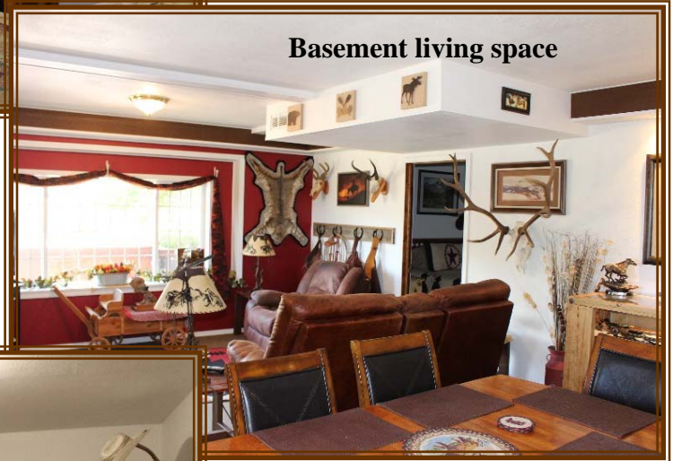
Basement living space