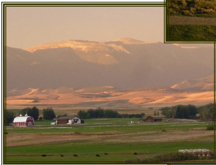
Views from the property