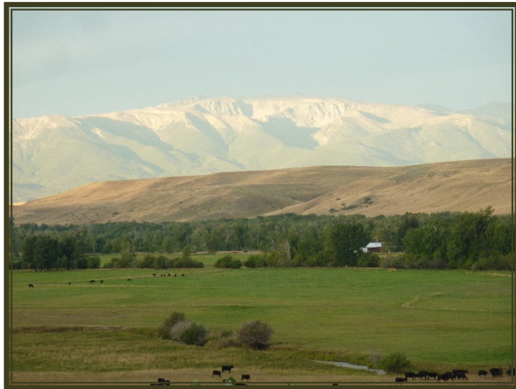
Beartooth Mountains, home of forty of Montana's tallest fifty mountain peaks.