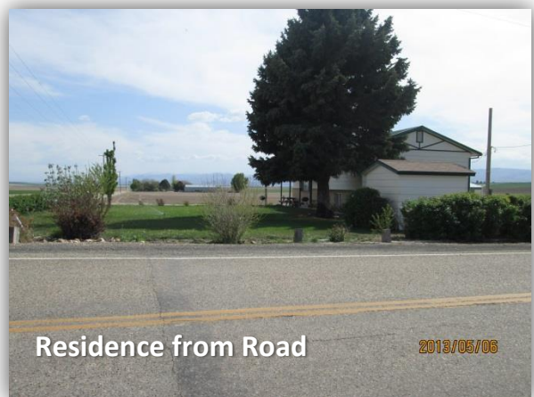
Residence from Road