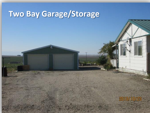
Two Bay Garage/Storage