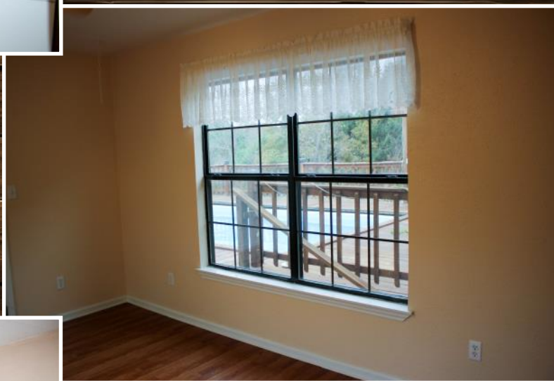
Large Family Room