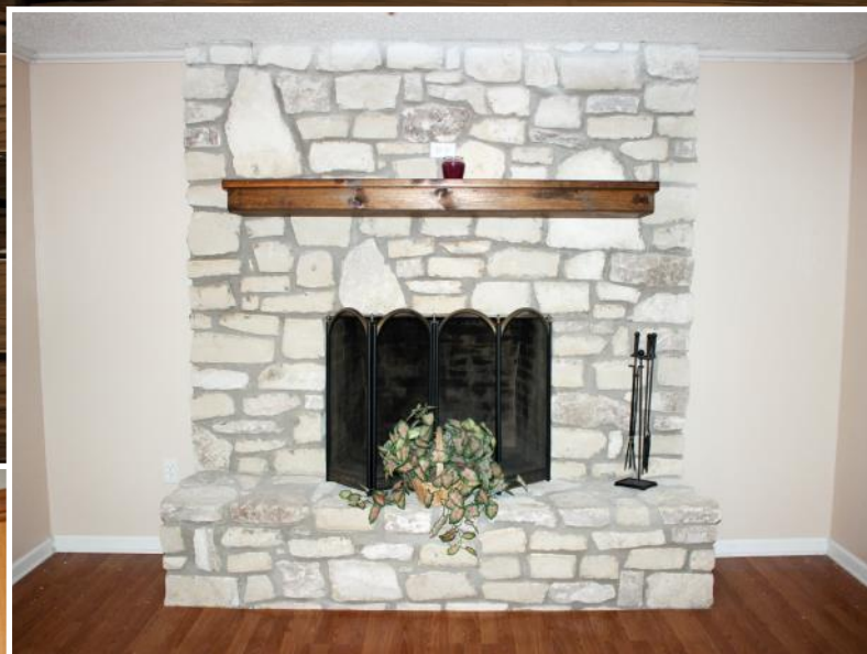
Stone Wood Burning Fireplace