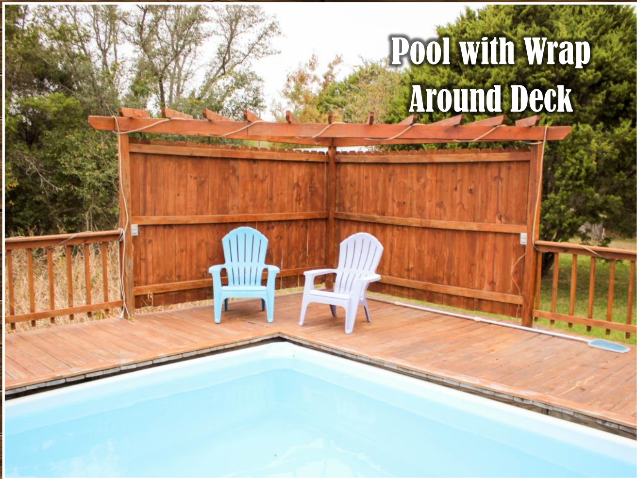
Pool with Wrap Around Deck