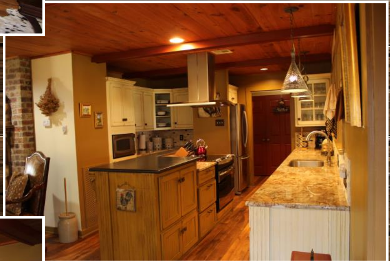
Country Style Living at its finest