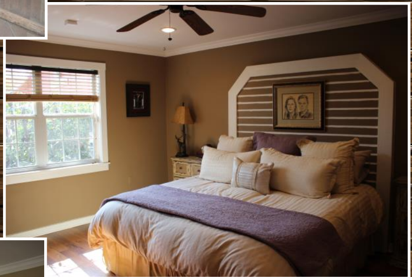
Guest Room with attached Bath