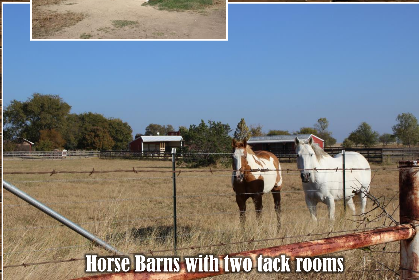
Horse Barns with two tack rooms