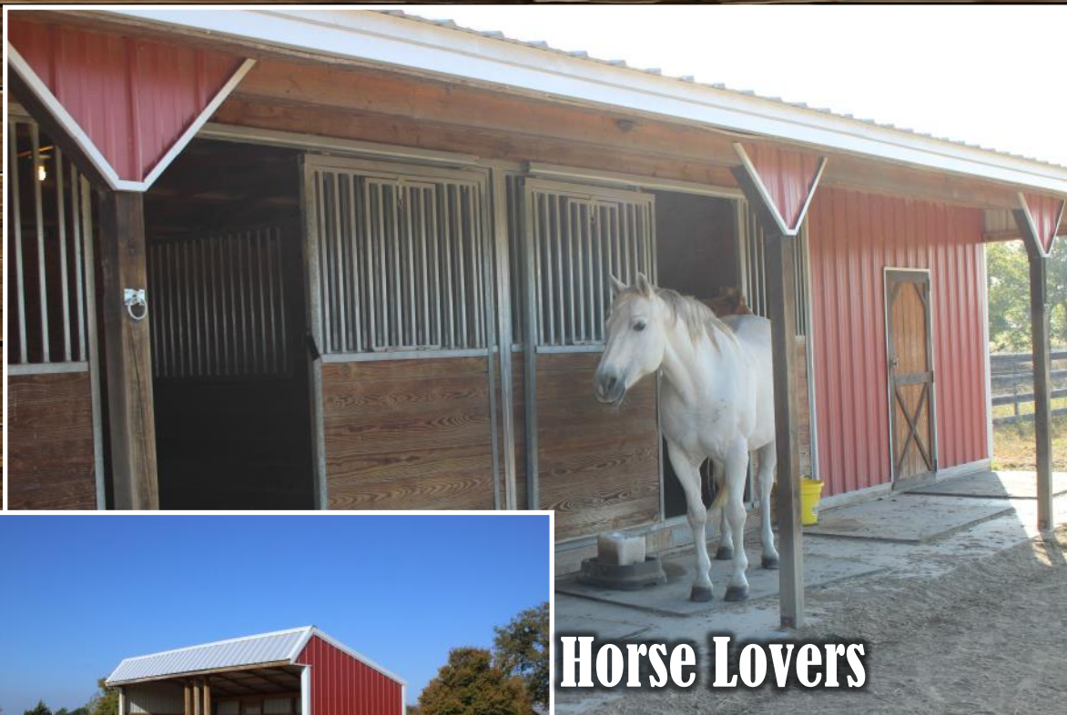
Horse Lovers Dream