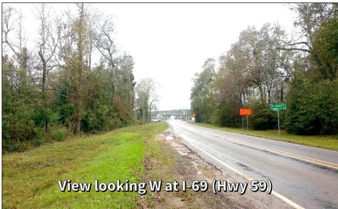
View looking W at I-69 (Hwy 59)