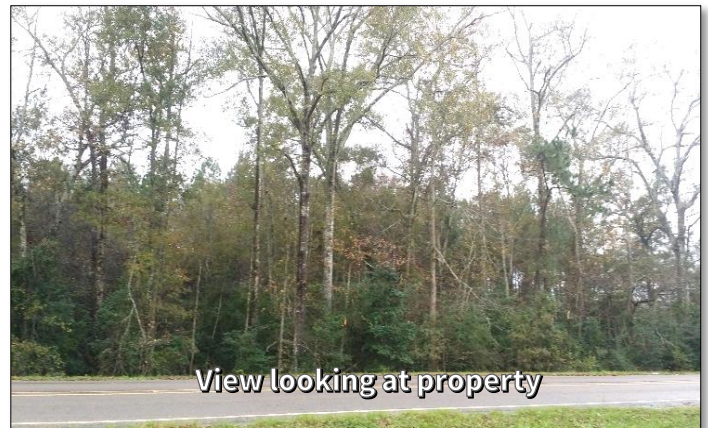
View looking at property